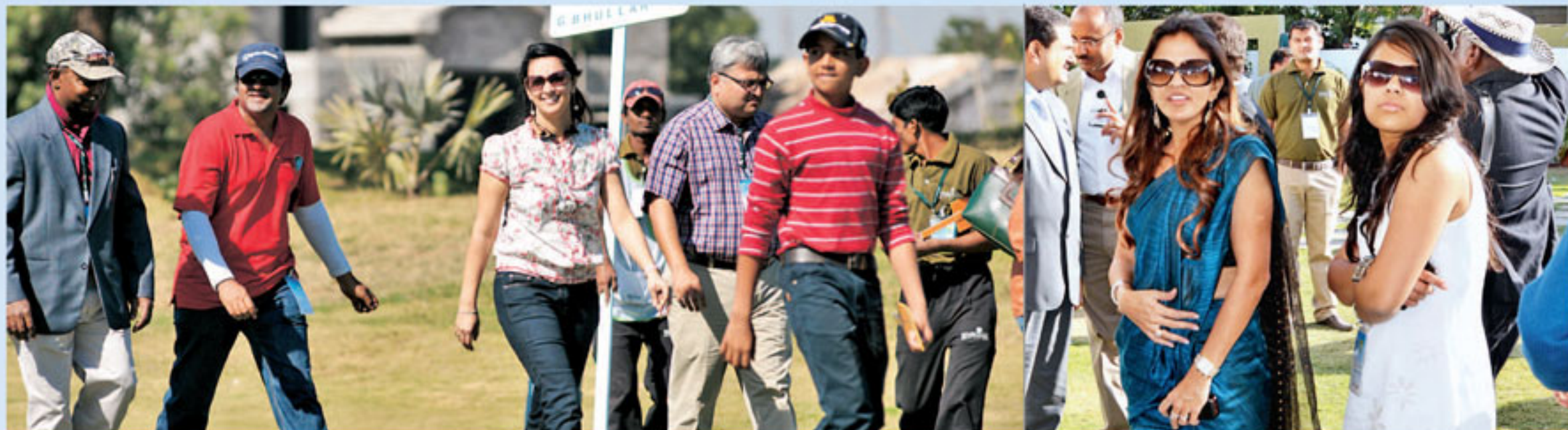
CHASING THE LEADER: Fans following Gaganjeet Bhullar at Kensville