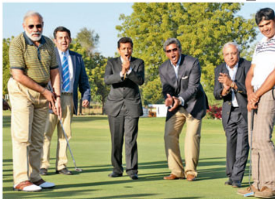
Chief Minister Narendra Modi's prize money of Rs 5 lakh will go into girl children's education that he promotes

"Sports is not in Gujarat's DNA. But now sports is creating a lot of business interest. And businessmen in Gujarat will only be happy to invest in sports," the chief minister said.